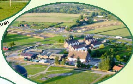
The Hop Farm Beltring