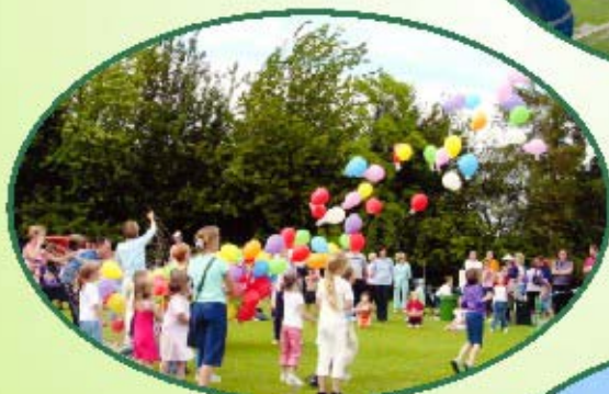
Primary School Fete