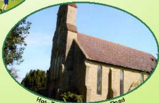
Holy Trinity Church Bush Road